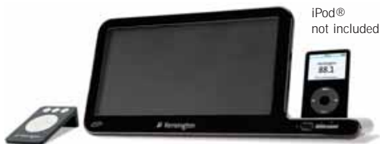
iPod® not included

I would like to receive future promotional offers from ACCO Brands/Quartet® Yes No