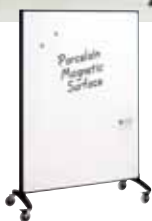
6640MB 6' x 4' Marker & Bulletin Room Divider