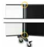
6640MB & 6630MB join together with 66C Connector Kit