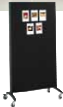
6630MB 6' x 3' Marker & Bulletin Room Divider